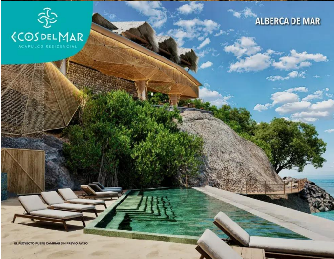
ALBERCA DE MAR

Sales and rentals +52 744 107 4026 +52 744 446 7080